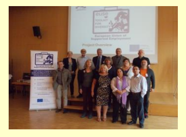
Partners celebrating the Launch of the Supported Employment Toolkit for Diversity.

"The toolkit is ideal for giving people a clear view of how to practice supported employment"